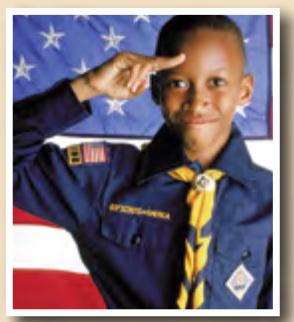
Scouts have assisted with Memori Day services at the Chattanooga National Cemetery for 99 years.

Installation of the Order of the Arrow Talidandaganu' Lodge 293, a Scout Honor Service Corps.