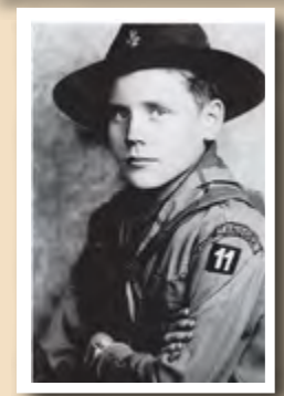
One of Chattanooga's first Scouts, circa 1914.